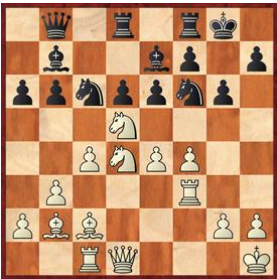
Romanishin-Petrosian, Yerevan 1975 Position after 16. Nc3-d5