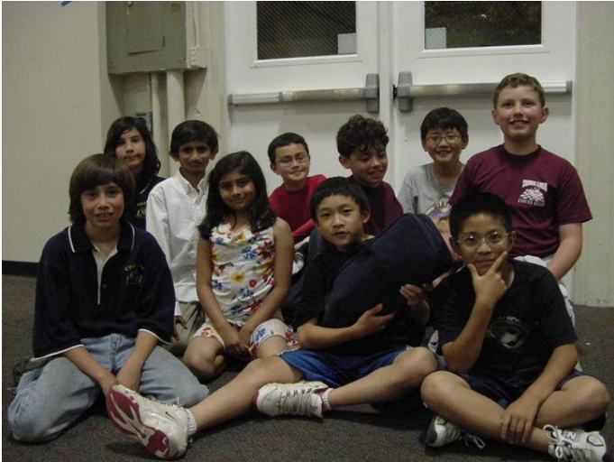
Are these kids having fun or what? Bughouse tournament winners.