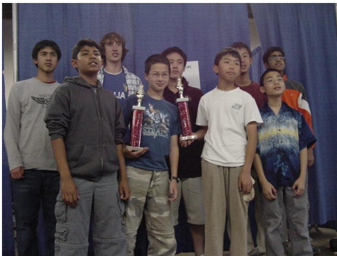
High School Team Champion Saratoga H.S. (back row) with Junior High Team Champion Redwood M.S.