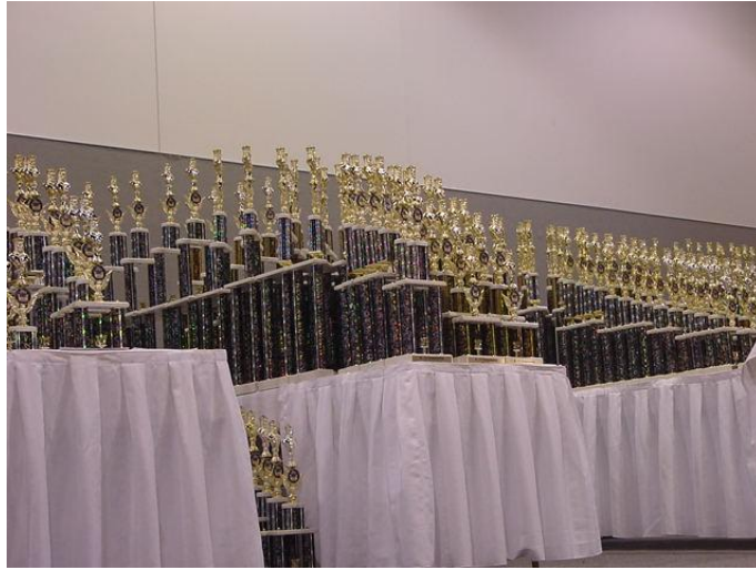
Lots of trophies!