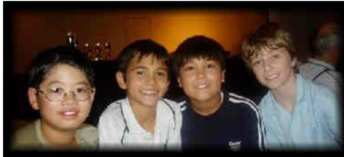
with his chess friends